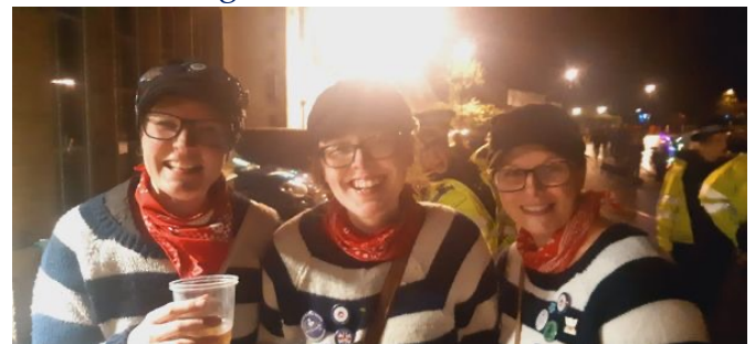
The editor did not realise that his wife had two identical twins!

And then it was over. A year of planning, culminating in a few well-deserved drinks